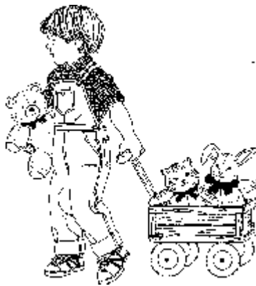
Cathy Smith minister of children